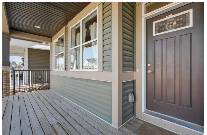
41 Legacy Glen Row SE, Calgary, AB

Main Floor Exterior Area 758.08 sq ft Interior Area 691.29 sq ft